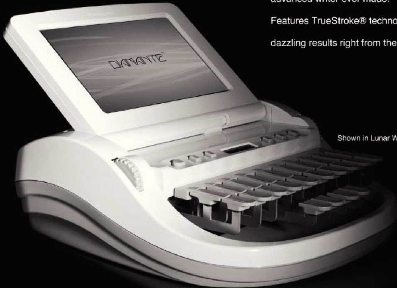
Shown in Lunar White

Features TrueStroke ® technology to give you dazzling results right from the start.